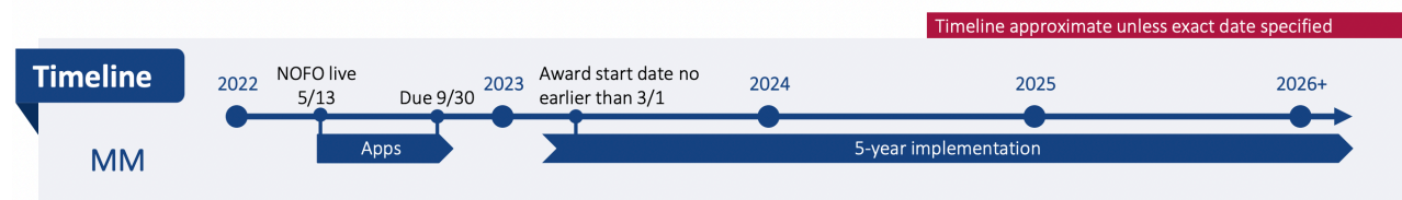
Timeline for the Enabling Middle Mile Broadband Grant Program

In early October, the National Telecommunications and Information Administration (NTIA) announced that it had received 235 applications seeking over $5.5 billion in federal grant support—confirming the staggering need for middle mile broadband infrastructure investment nationally. Responses to New Mexico’s RFIs confirm our need, as well, for strong investment in robust, redundant, and resilient broadband infrastructure along priority corridors throughout the state.