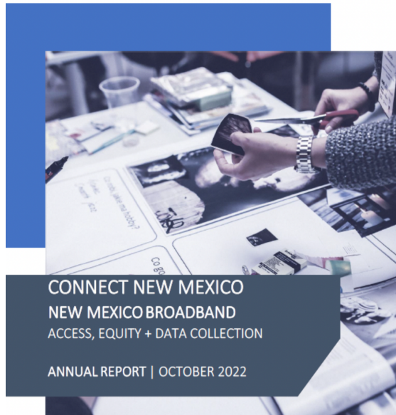
Connect New Mexico Council and Office of Broadband Access and Expansion Governor Michelle Lujan-Grisham

Meeting its October 1 statutory deadline, the Office of Broadband Access and Expansion (OBAE), in coordination with the Connect New Mexico Council, reported progress toward meeting its statutory obligations per the Broadband Access and Expansion Act ( Senate Bill 93 ) and the Connect New Mexico Act ( House Bill 10 ). Just as important, the report noted significant progress toward meeting the broadband moment—the unique confluence of historic state and federal funding opportunities, cross-sector and public interest alignment, and vision for universal access to reliable, affordable, high-speed internet statewide.