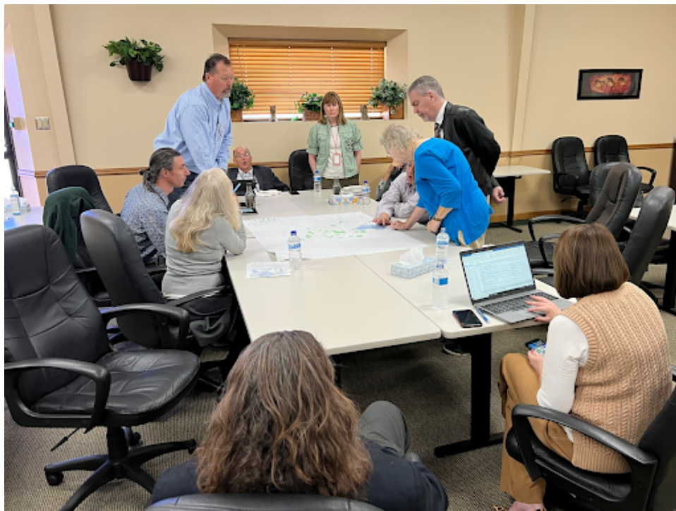
OBAE staff discussing broadband mapping in Clovis

The meeting agenda included discussion of the Connect New Mexico Pilot Program, opportunities for tribal outreach and engagement, and updates from each of the Connect New Mexico Council's six working groups: digital equity and inclusion; grants programming; mapping, data, and evaluation; permits, rights-of-way, and pole attachments; regional planning and community engagement; and tribal outreach and programming. Future editions of our New Mexico Broadband Connections newsletter will feature the work of the council and its working groups.