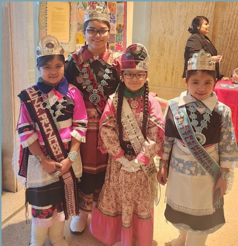
Zuni Pueblo Royalty