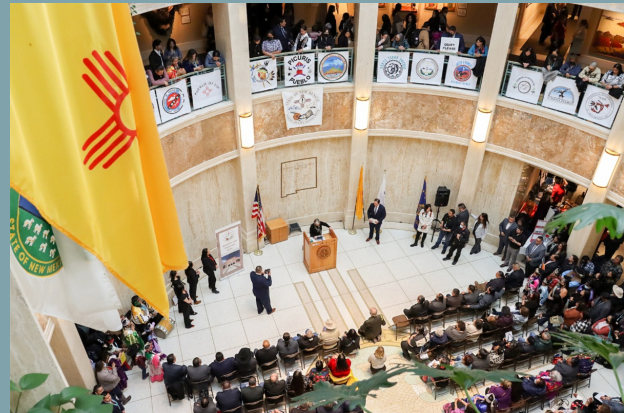
Governor Lujan Grisham Remarks at American Indian Day 2023

American Indian Day at the New Mexico Legislature is one of the most attended days during the legislative session. Connect New Mexico Council (CNMC) Tribal Working Group had a table, encouraging attendees to sign up for the New Mexico Tribal Broadband electronic newsletter , and learn more about CNMC Tribal Working Group .