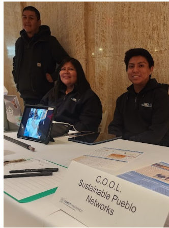
Cultivating Our Own to Lead (COOL) Building and Maintaining Sustainable Pueblo Networks