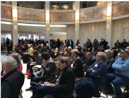
Great turnout for Inaugural New Mexico Broadband Day!