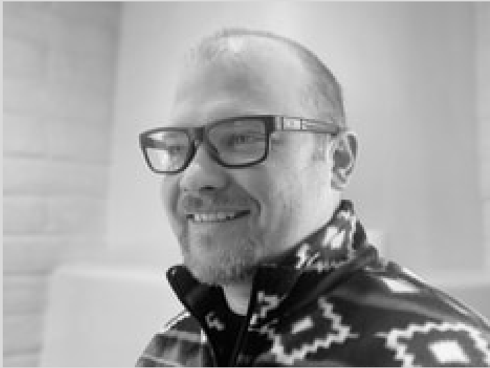
January 16, 2024 nmtribalbroadband@gmail.com