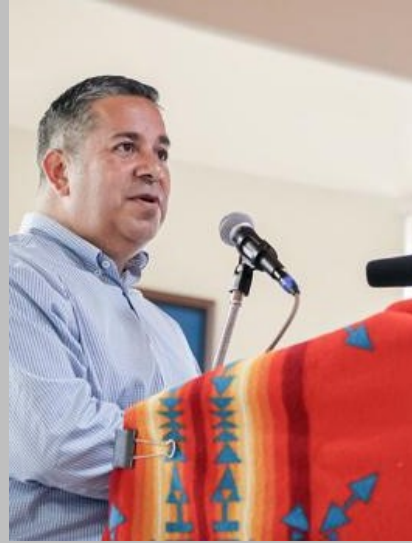
Sen. Ben Ray Luján speaks at the news conference.