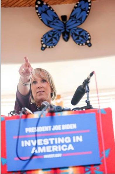
Gov. Michelle Lujan Grisham at Santa Fe Indian School gathering to hear the announcement New Mexico will receive $675 million in federal funding for broadband initiative.