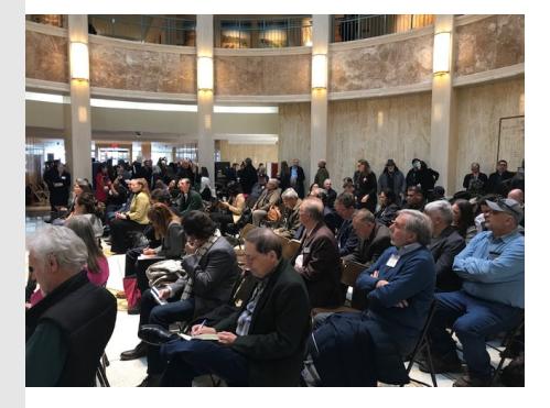
Great turnout for Inaugural New Mexico Broadband Day!

On February 15, 2023, during New Mexico Broadband Day at the Roundhouse, Governor Michelle Lujan Grisham announced the official Executive Office Proclamation