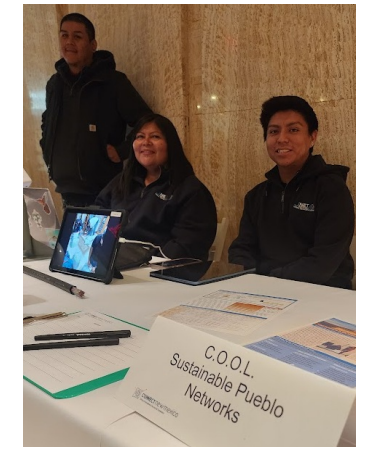
Cultivating Our Own to Lead (COOL) Building and Maintaining Sustainable Pueblo Networks

Connect New Mexico Council and Chief Technology Director at Santa Fe Indian School