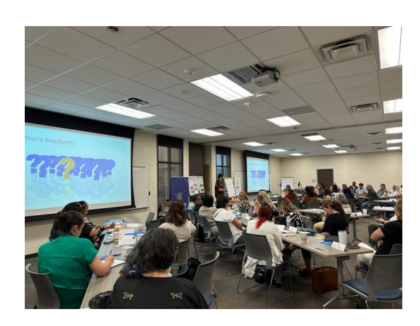
Las Cruces Boot Camp

On June 28th at Dona Ana community college in Anthony and June 29th at Tesuque Pueblo. We hosted elected officials, nonprofits, digital equity advocates, and broadband community leaders.