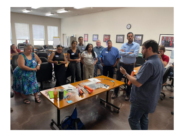
Tesuque Pueblo Boot Camp

SAVE THE DATE- Broadband & Bratwurst Please RSVP by July 28th!